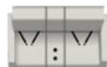
DUAL POWER THEATER SEATS IPO Dinette (24RW and 24SSSFXM)