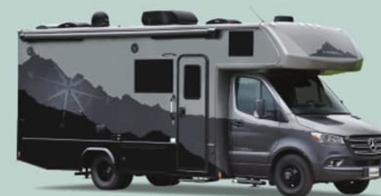
Freedom Dark shown with optional black aluminum wheels