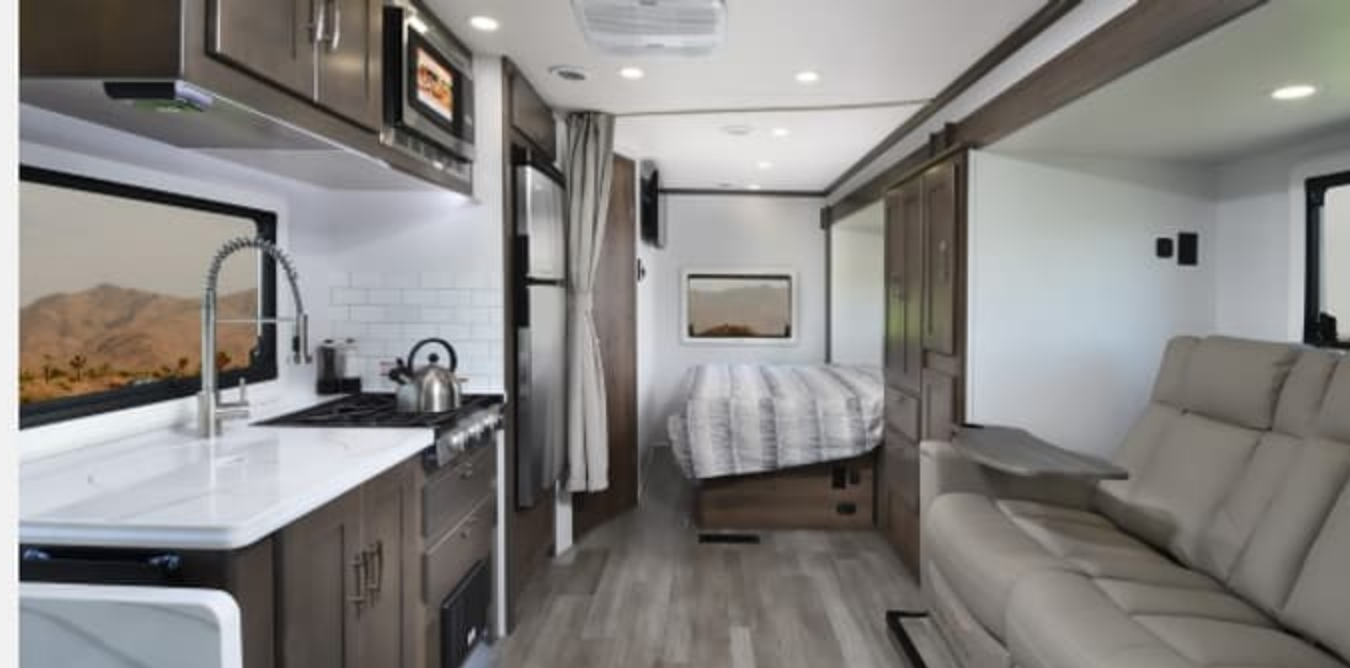
24FW shown with Driftwood II cabinetry and Milano II décor.