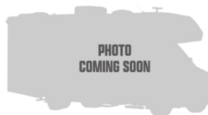
Platinum (Single Color Full Body Paint)