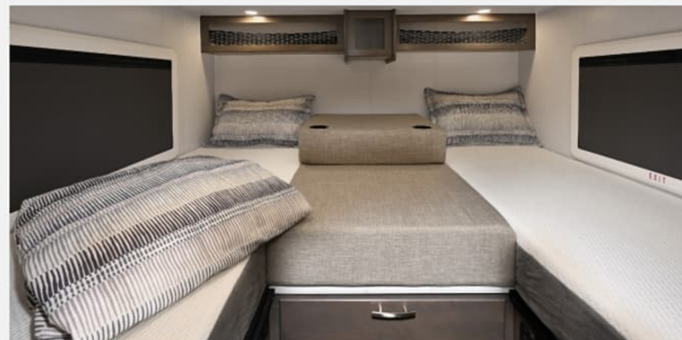
24TW shown with Driftwood II cabinetry and Milano II décor.