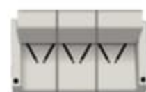
THREE-SEAT POWER THEATER SEATS IPO Dinette (24FW)