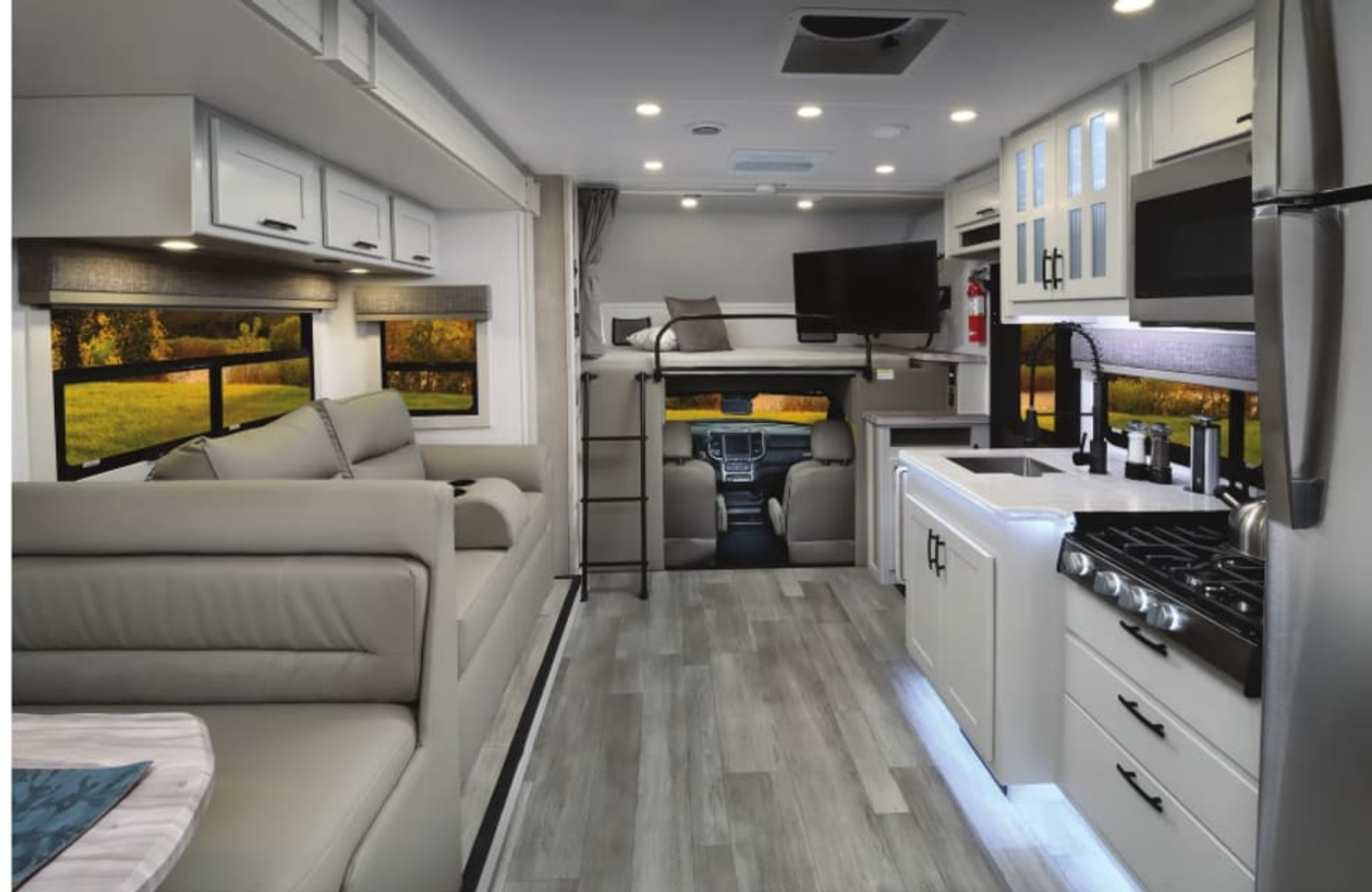
30FW with Mindful Gray cabinetry and Milano II décor