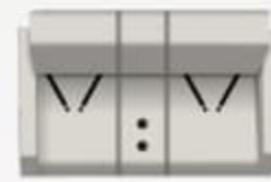
DUAL POWER THEATER SEATS IPO Dinette (28SS) IPO Sofa (30FW)