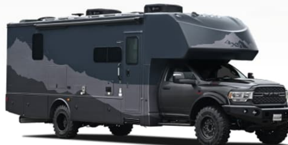
Shown in Xplorer Midnight

Available in Admiral Blue, Granite, Khaki, Magnetic and Merlot. Photos coming soon.