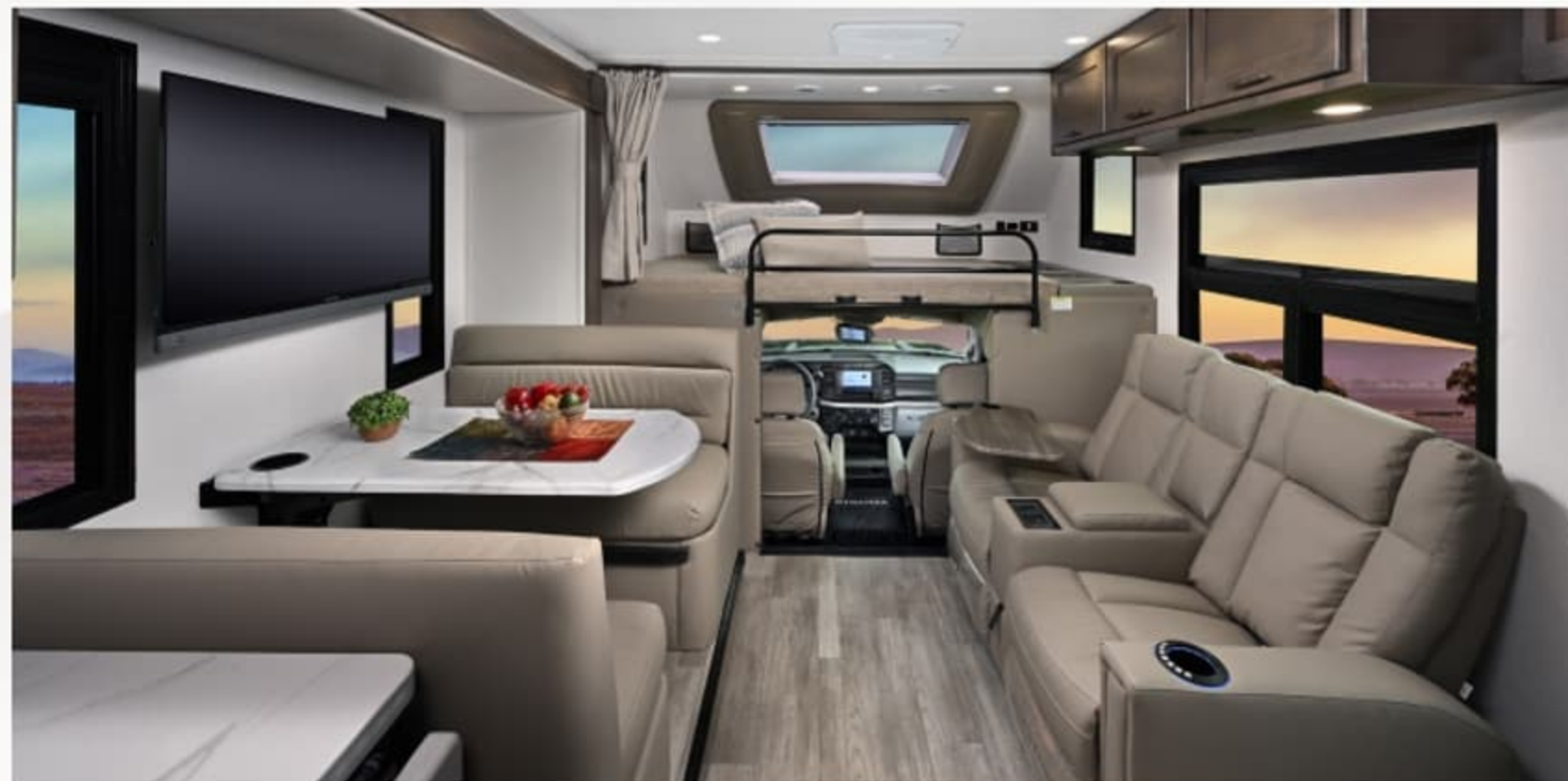
31KS with Driftwood II cabinetry and Milano II décor