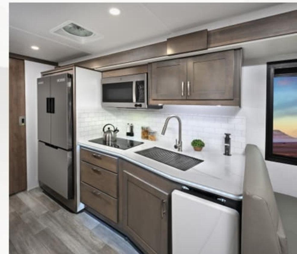
31KS with Driftwood II cabinetry and Milano II décor