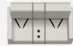
DUAL POWER THEATER SEATS IPO Sofa (30FW)