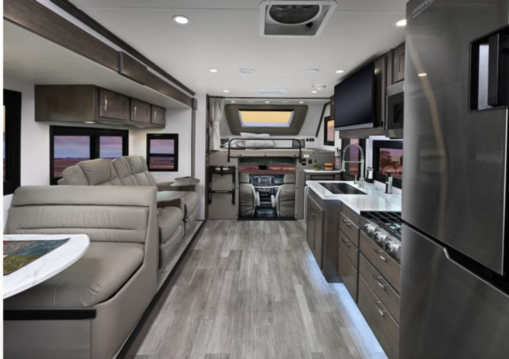
30FW with Driftwood II cabinetry and Milano II décor