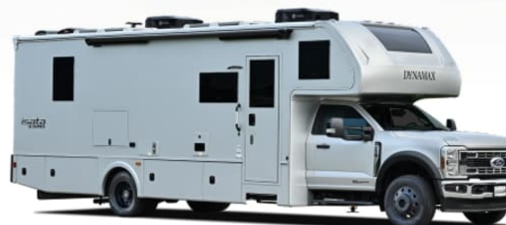
Platinum (Single Color Full Body Paint)