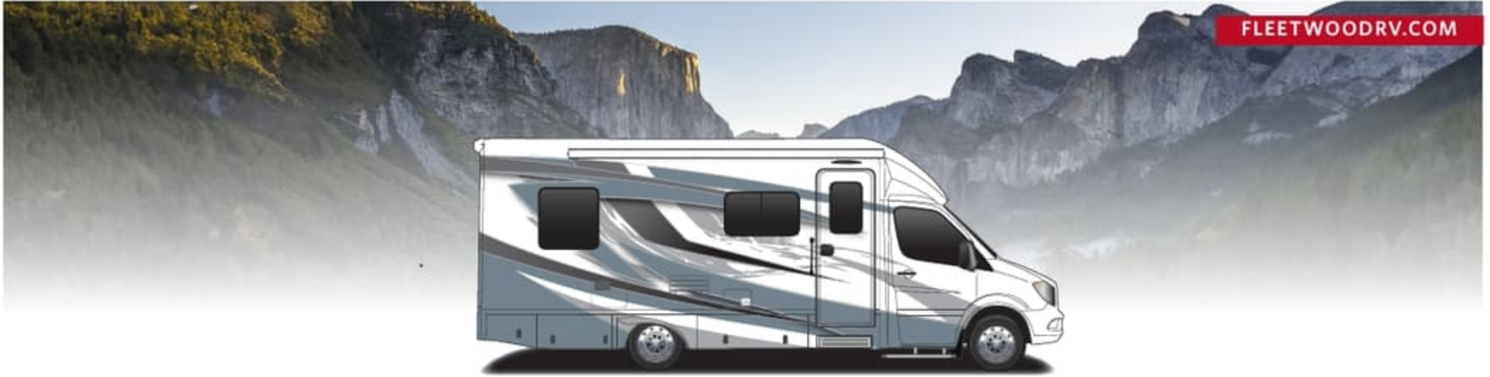
2026 INSIGHT - Aero Cap shown with Heritage Exterior Graphics Illustration only, actual production model may vary.