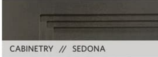
CABINERY // SEDONA