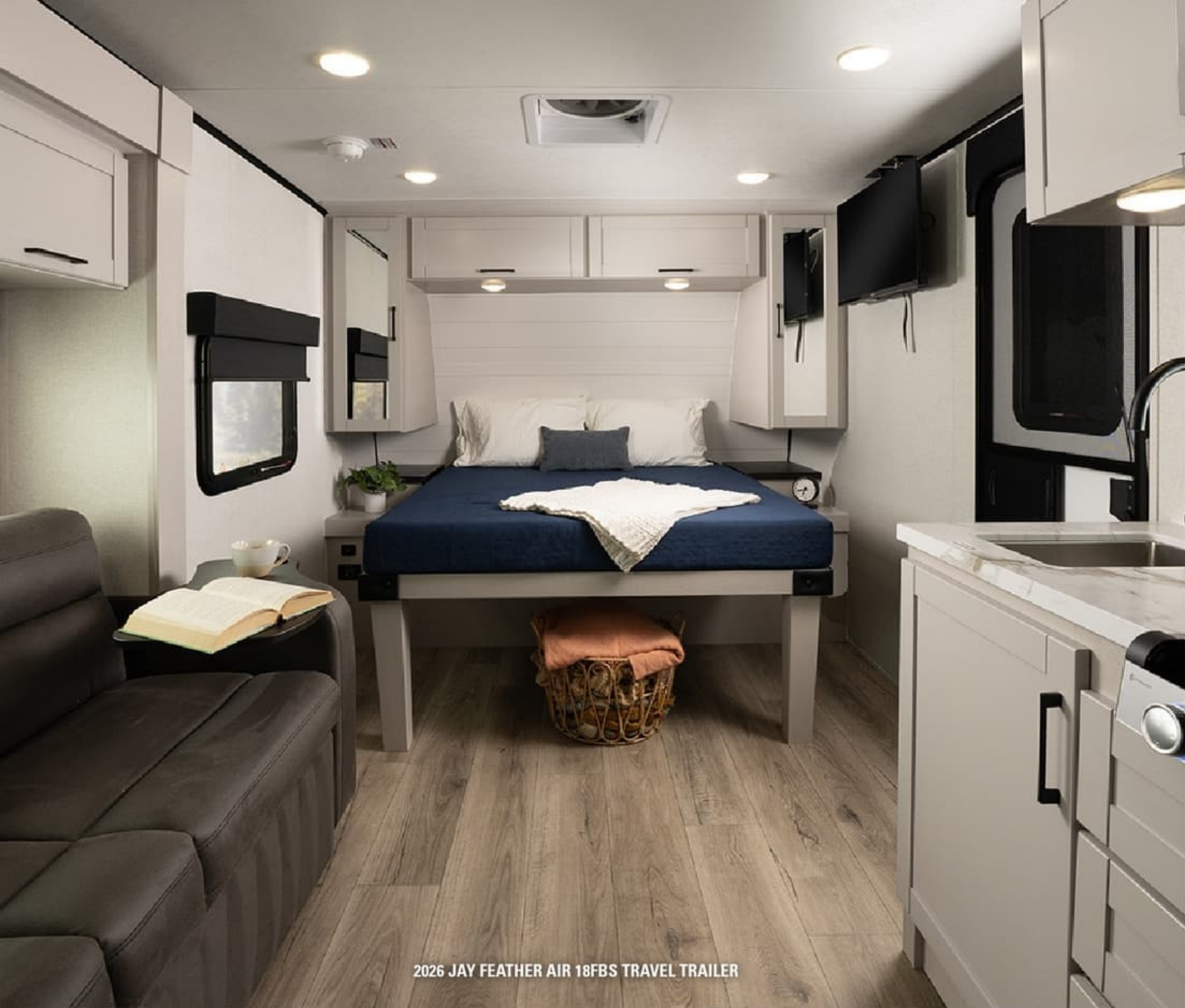
2026 JAY FEATHER AIR 18FBS TRAVEL TRAILER