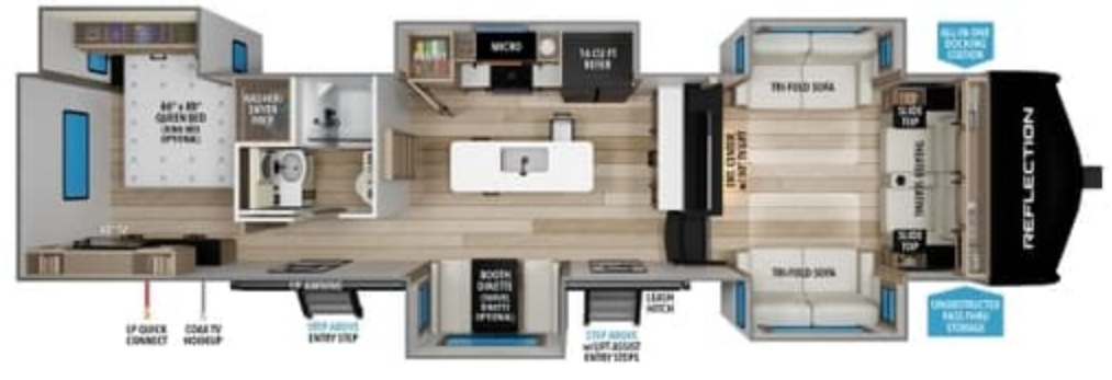
360FLS UVW 1 HITCH 1 LENGTH 2 HEIGHT 3 CAPACITY 12,388 2,600 39' 2" 13' 3" 74 78 39