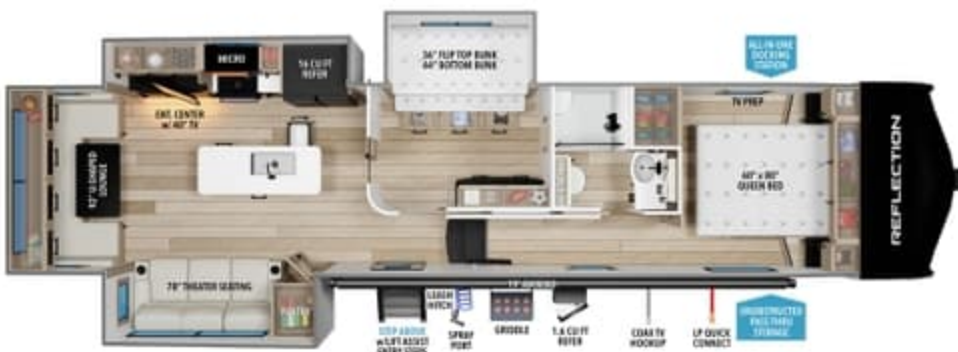
324MBS UVW 1 HITCH 1 LENGTH 2 HEIGHT 3 CAPACITY 11,200 2,000 37' 13' 1" 74 78 39