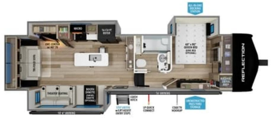
337RLS UVW 1 HITCH 1 LENGTH 2 HEIGHT 3 CAPACITY 11,200 2,300 35' 7" 13' 3" 74 79 39