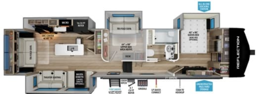
367BHS UVW 1 HITCH 1 LENGTH 2 HEIGHT 3 CAPACITY 12,900 2,550 41' 1" 13' 3" 74 78 39