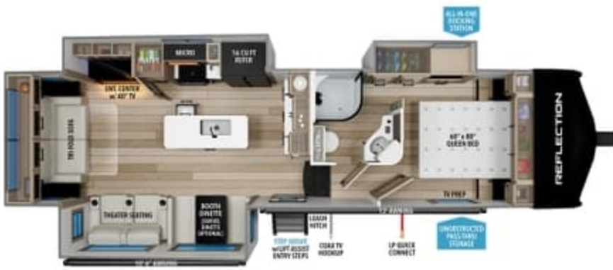
303RLS UVW 1 HITCH 1 LENGTH 2 HEIGHT 3 CAPACITY 10,100 1,980 32' 10" 12' 3" 74 87 47