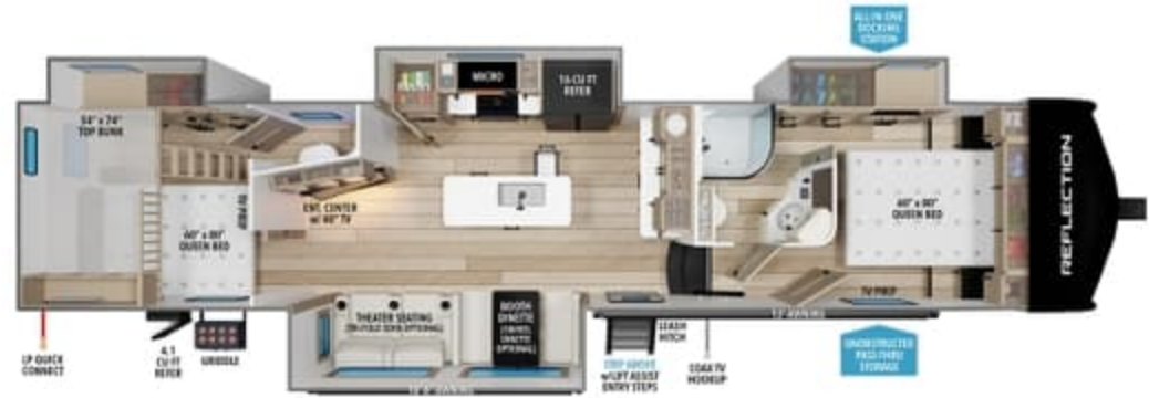
362TBS UVW 1 HITCH 1 LENGTH 2 HEIGHT 3 CAPACITY 12,500 2,400 39' 11" 13' 5" 74 79 79