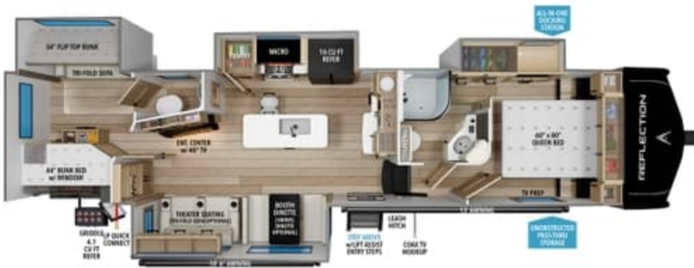
311BHS UVW 1 HITCH 1 LENGTH 2 HEIGHT 3 CAPACITY 11,700 2,450 36' 11" 12' 11" 74 87 87