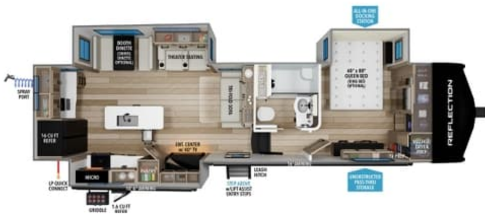
320MKS UVW 1 HITCH 1 LENGTH 2 HEIGHT 3 CAPACITY 11,100 2,200 34' 9" 13' 3" 74 78 39