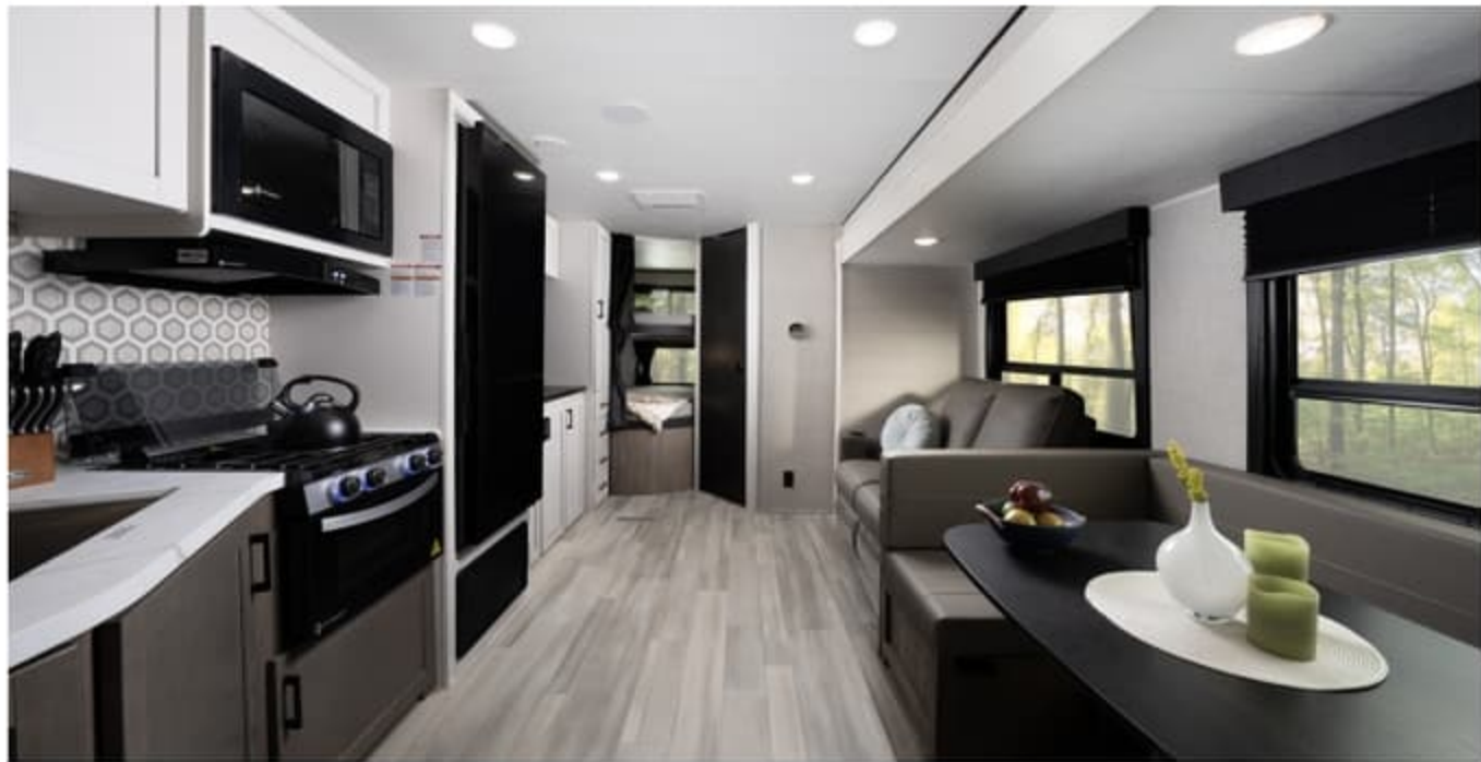
2026 Colt 26DB TT