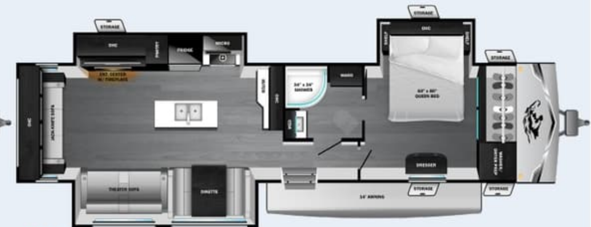
33RLT OPTION A, B & C