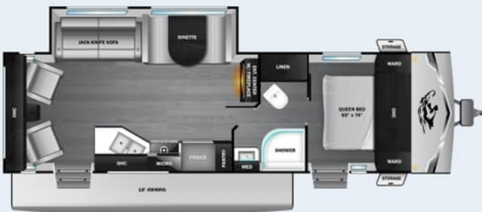
26RCS OPTION A & B