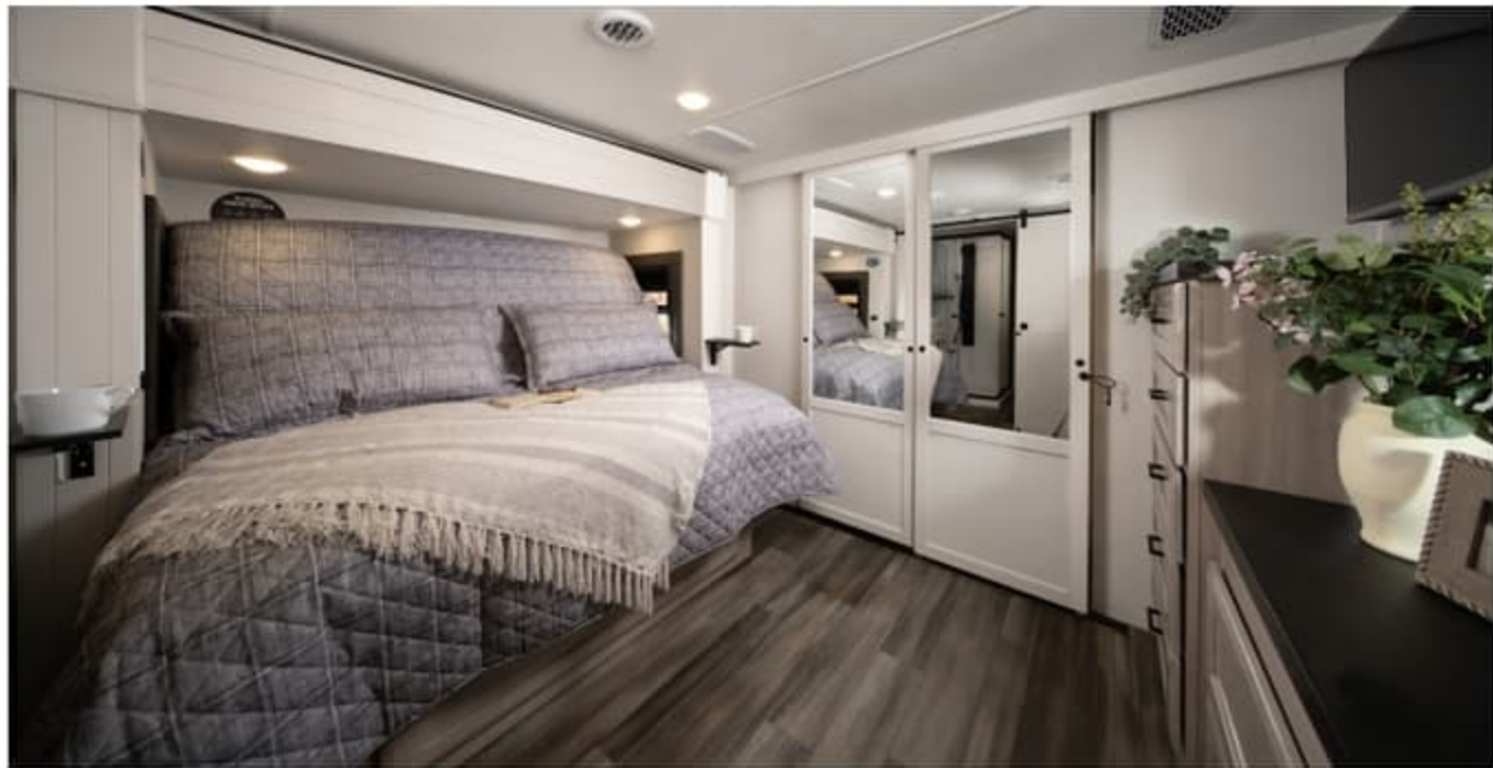
2026 Open Range 3X 390TBS FW